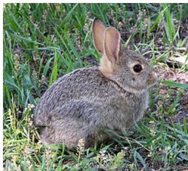
Figure 1: A rabbit

Floats are able to ‘float’ around a LaTeX document to ensure that spacing is well used. Importantly , this will never change the ordering of floats within a class.