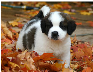
Figure 3: A puppy with the !htbp option

Importantly these constraints can be combined. For example the puppy of Figure 3 is placed using the !htbp option.