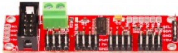
Figure 1.2: This is a servo controller.